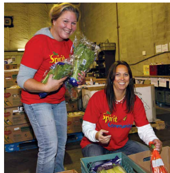
Sorting food at the Red Deer Food Bank