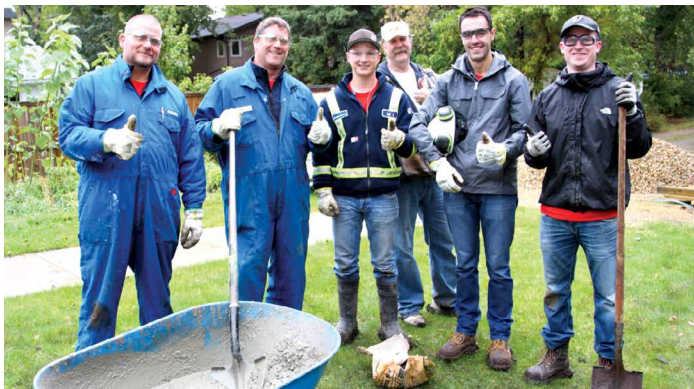
Helping Central Alberta Residence Society build a fence