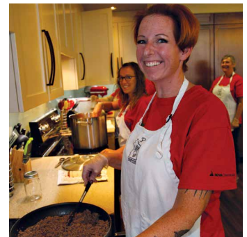
Cooking at Red Deer Ronald MacDonald House