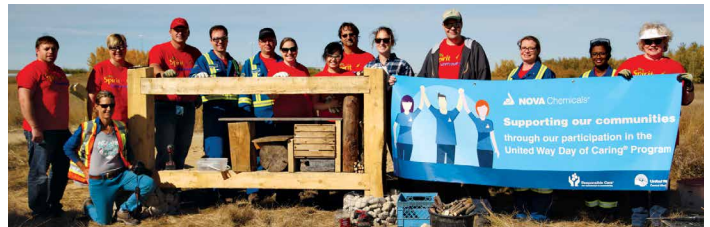
Our Environment Team building the Pollinator Hotel at the NOVA Chemicals Community Nature Trail

An essential aspect of our annual United Way Campaign is our participation out in the community, helping agencies with a variety of activities that will help them deliver their services better. This year, more than 175 of our employees devoted more than 1,300 hours of support (dollars saved can be re-directed into agency programming). Projects included technical support at Bethany CollegeSide and building a fence for Central Alberta Residency Society. These pictures tell more of the story we're so proud of!